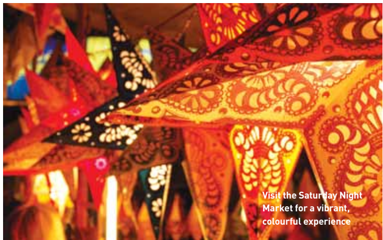
Visit the Saturday Night Market for a vibrant, colourful experience

NB: Flight times will vary according to size of jet, number of passengers, seasons and weather variations. Please contact your jet management company or a jet charter company for more information on these.