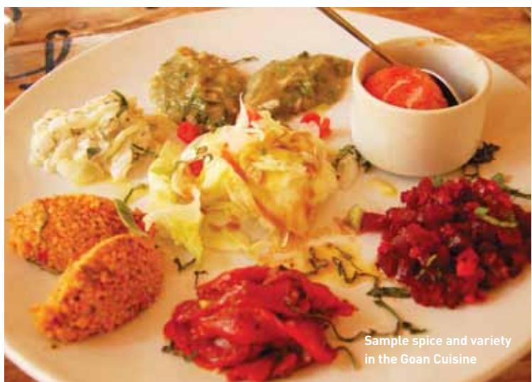
Sample spice and variety in the Goan Cuisine